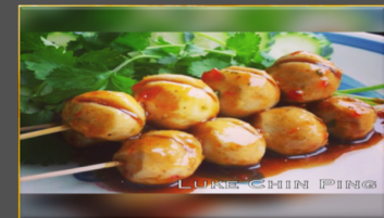
Grilled Pork Balls 7 Served with homemade sweet chili sauce