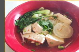
Tofu noodle soup 9 Your noodle choice with soft tofu, Chinese green vegetable, cilantro, scallion, bean sprout in clear broth*. * Chicken stock