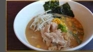
Miso Ramen 10.95 (Japanese style with Bamee only/Spicy broth available) Bamee noodle in miso broth with corn, roast pork, sesame seeds bean sprout, chopped ginger, seaweed and scallion.