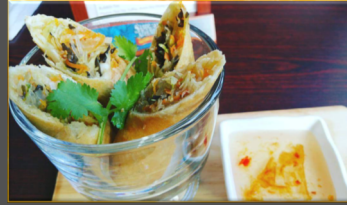
Crispy Rolls 5 Crispy spring rolls filled with marinated mixed vegetable and glass noodles, served with house plum sauce.