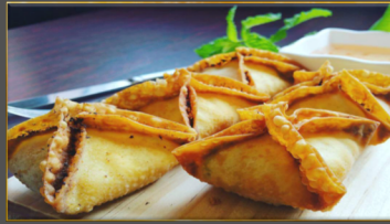
Crab Rangoon 6 Crispy wonton with cream cheese, imitation crabmeat, real crab meat, onion, curry powder and scallion stuffing