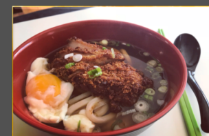
Udon with Crispy chicken or Pork 12 Thick noodle in Japanese soup base with our delicious crispy chicken or roasted pork, bean sprout, scallion and a soft-boiled egg. (Also available with Ramen Noodle)