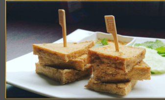
Fried Tofu 5 Crispy soybean curd served with Thai sweet dipping sauce with ground peanut