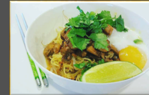
Dry Noodle with Pork (spicy) 9.50 Hot and Sour dry noodle with sweet pork, bean sprout, ground peanuts, cilantro, chili pepper, and scallions. (Egg is extra)