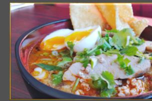
Clear Tom yum Noodle soup(spicy) 9.95 Your noodle choice with ground pork or chicken, fish cake, crispy wonton sheet, bean sprout, cilantro, scallion ground peanut, green, chili pepper, garlic oil and lime juice in authentic (Add boiled Egg $1.50)