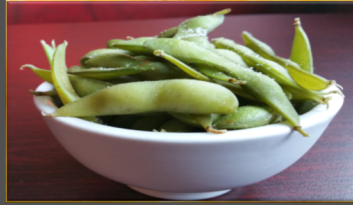
Edemame 4.95 Lightly salted boiled soybean