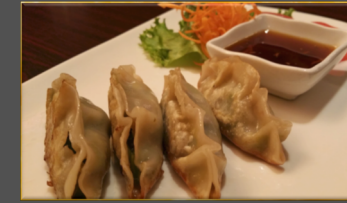
Veggie Gyoza 6 (Pan fried) Cabbage, tofu, carrot, onion, edamame soybean and bamboo shoot stuffing served with soy sauce