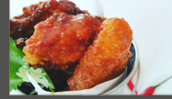
Bamee Wings 7 Breaded chicken wings (Served with sweet chili sauce upon request)