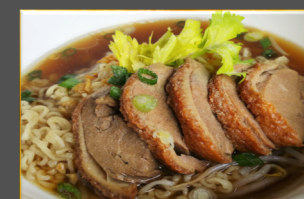
Noodle soup with roasted duck 12.95 Your noodle choice with roast duck, celery, bean sprout, cilantro and scallion. (Add wonton $2)