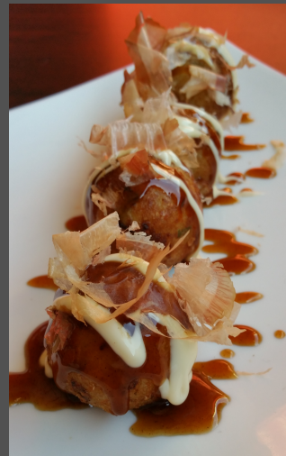
Tako Ball 7 Japanese squid balls with fish flake, Japanese Mayonnaise, Sriracha, BBQ sauce and seaweed sprinkles