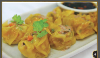
Shumai 7 Open-topped steamed or fried minced chicken and shrimp, scallion, carrot and mushroom dumpling served with house soy sauce