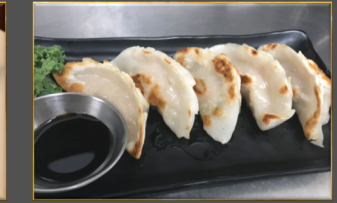
Pork Gyoza 7 (Steamed or Pan fried) Homemade ground pork, cabbage, mushroom, and scallion stuffing served with house soy sauce.