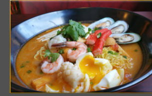
Creamy Tom yum seafood(mild spicy) 11.95 Your noodle choice with Jumbo shrimp, squid, mussel, imitation crabmeat, cilantro, scallion in creamy hot and sour broth. (egg extra)