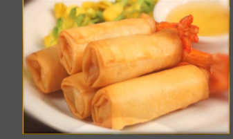
GGB 7 Crispy whole shrimp marinated with thin sliced ginger and wrapped with egg roll sheets served with house sweet and sour dipping sauce