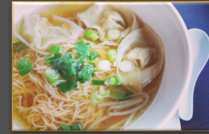
Wonton Noodle Soup 9.50 Your noodle choice with minced pork and shrimp wonton, roast pork, scallion, cilantro, garlic oil and bean sprout in clear broth.

Your Choice: Rice Noodles or Bamee (Yellow Noodles)