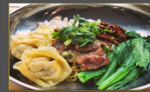
Bamee Hang 10.95 Bamee noodle with roasted pork, wonton, Chinese vegetable, cilantro, scallion with a spread of our homemade roasted pork sauce. Delicious!